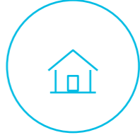
Small/ Medium Building Size