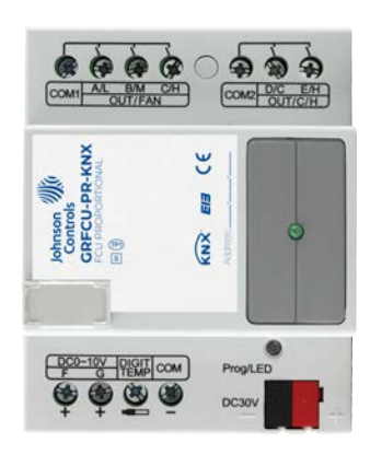
Figure 2: GRFCU-PR-KNX Fan Coil Unit controller

Use the Fan Coil Unit (FCU) controller to control fan coil units, floor heating, or switch actuators. Depending on the design of the device, use fan coil units in 2-pipe or 4-pipe systems. The FCU controls up to three fan speeds (relay or 0 V to 10 V outputs) as well as heating or cooling valves, proportional or electro-thermal valve, respectively. The mode of control is based on two-step control or a time-discrete PI controller with set-point or actual value comparison. Regulate valves and the fan directly by devices through the closed loop of this controller. In floor heating, the FCU controller can control up to seven channels. The floor heating channel control uses a time-discrete PI controller with setpoint or actual value comparison.