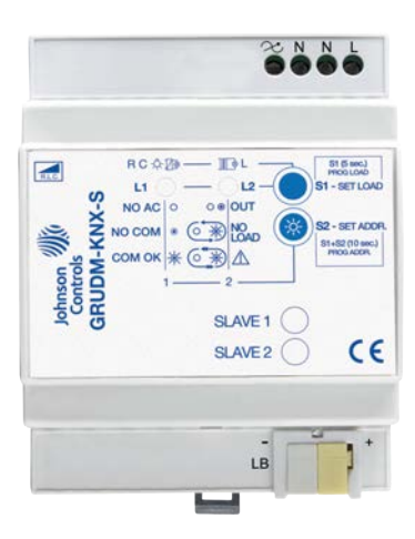
Figure 9: GRUDM-KNX-S universal dimmer

GRUDM is a KNX on or off dimmer 1-channel that acts as a master dimmer. Connect up to two subordinate modules with identical characteristics to the master on or off dimmer, that connects through a local 2-wire bus. Dimmers turn off part of the waveform of the input voltage, which results in reduced lamp output.