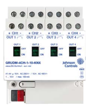
Figure 12: GRUDM4CH110-KNX channel dimmer

The GRUDM-4CH-1-10-KNX is a KNX 4-channel dimmer with switching and brightness settings for lamps that operate with 110 V interface.