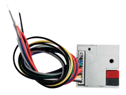
Figure 8: GRIO-xCH-SI-KNX 2 and 4CH switch interface

The device interfaces to dry contacts with two or four input channels, for example, sensors, buttons, and two or four low voltage or current outputs for LED signal indicator lamps. These devices are extremely compact in size, 34 mm x 34 mm x 11 mm, for use in installations with reduced in-wall space. The digital inputs can interface sensors and buttons, the four low voltage output channels can drive LEDs for synoptic panels or switches. Outputs can drive low voltage LEDs. There are also eight blocks of logic functions freely configurable by ETS. The device contains a KNX communication interface.