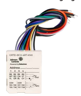
Figure 7: GRTEI8CH4RT-KNX analog-digital module

Digital inputs can interface sensors, and buttons, while four low voltage or current outputs channels drive LED signal indicators. Use configurable analog inputs for temperature controls and sensors. Inputs five to eight, set as analog inputs, enable up to two temperature probes with on or off threshold, and two thermostats to control heating and cooling systems valves, 2-pipe and 4-pipe fan coils.