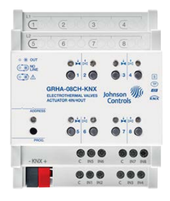
Figure 11: GRHA-08CH-KNX electrothermal valves