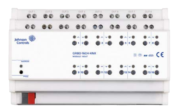
Figure 5: GRBO-16CH-KNX universal module

The DIN RAIL 16 Output Module is an EIB/KNX DIN rail mounting device with 16 relay outputs 16 A to 230 VAC. Connect digital inputs to free potential contacts to interface with sensors as well as conventional buttons. The device includes manual buttons for local relays switching and LEDs for operation indication.