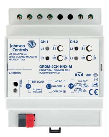
Figure 10: GRDM-2CH-KNX-M dimmer